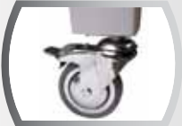
Heavy duty casters