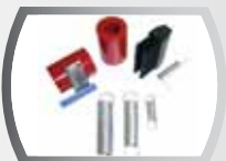
Spare parts kits