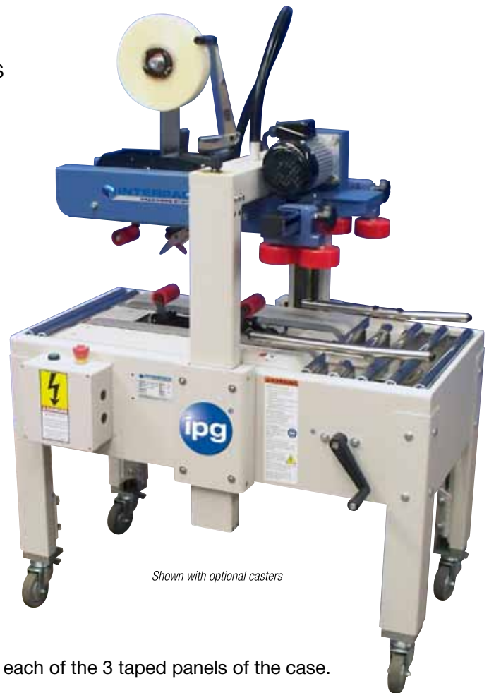
Shown with optional casters

When you compare features, benefits and value, Interpack Case Sealers are the right choice for operators, plant engineers, maintenance and purchasing.