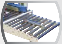
Infeed table with "T" rail hold down